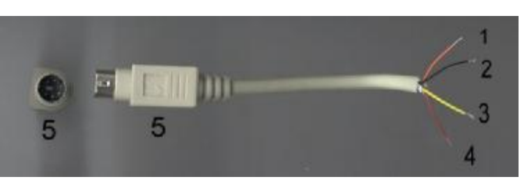
Figure 5: Male PS/2 plug pinouts, connects to target PIC