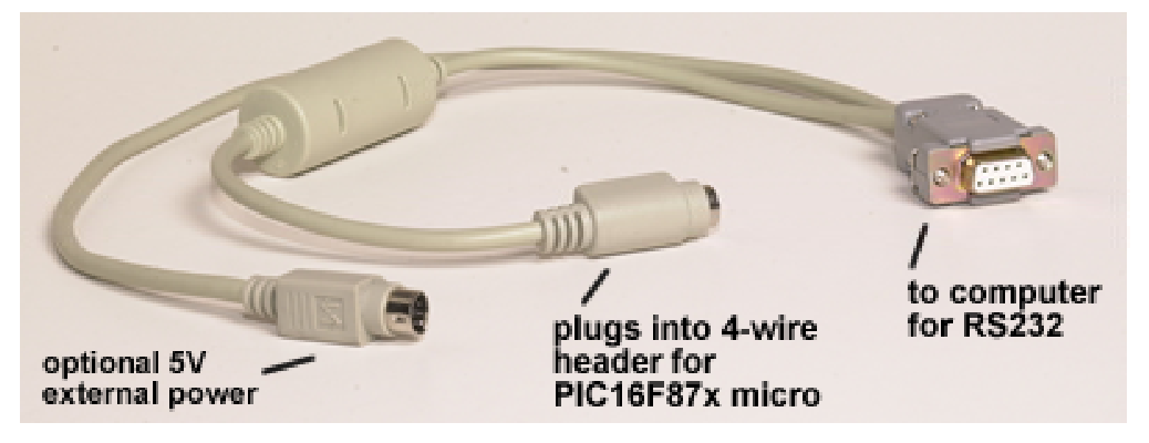
Figure 1: Product photo

Most microcontrollers work at +5V / 0V logic levels. Therefore, this adaptor will enable serial communications for the Microchip, Atmel, Motorola, Scenix, Texas Instruments, Philips, 8051 series and Hitachi microcontrollers, to name a few.